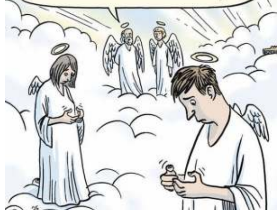
Cell Phone cartoon by Dottie Urban

Most of the new arrivals seem incapable of conversation. They just stare at their hands in despair.